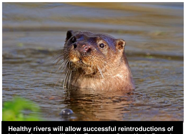
Healthy rivers will allow successful reintroductions of beloved species like the European Otter

An overall target for water: We have some of the worst-quality rivers in Europe. Pollution from agriculture, sewage, roads and plastics is destroying freshwater habitats and making our rivers dangerous for both humans and wildlife. Currently River Basin Management Plans set a target for improvement, but after 2027 there will be no overall target holding the Government to account. The four targets proposed could mean we see improvements in pollution from