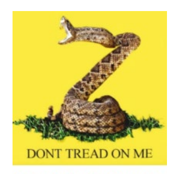
Cass County Patriots