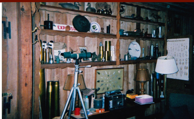
A view from Rockefeller's office