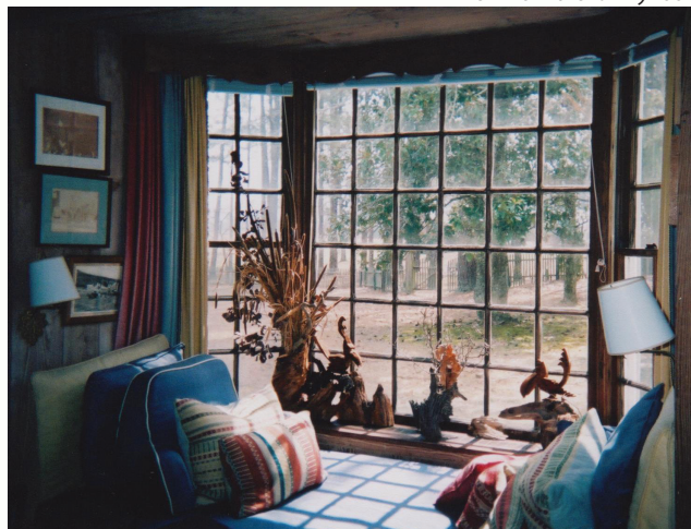
A view from the family room